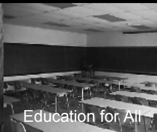
Education for All