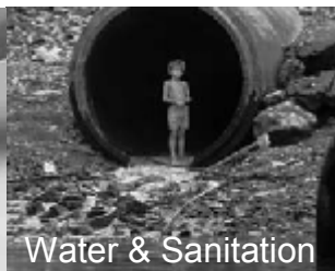
Water & Sanitation