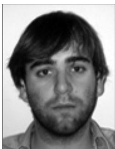
By Anthony Miles, Policy and Research Assistant, Stakeholder Forum

On 6 th March 2006 Stakeholder Forum held its final roundtable in preparation for CSD-14. It brought together an array of stakeholders, initially to enjoy the great views over St Paul's Cathedral and the City of London, but later to discuss and find common ground on the issue of mobilizing finance for renewable energy.